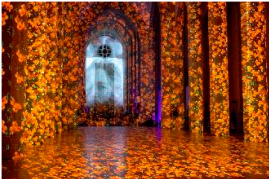
Poppy Fields Installation at Guildford Cathedral

The installation artwork 'Poppy fields' also consisted of giant poppies being projected onto the Naves of the Cathedrals, with visitors invited to walk through the poppies and be immersed in the light and sound, the journey then contained around the Cathedral spaces with sound and light installation artwork and sculpture transforming the spaces of the Cathedrals - the south and north transepts, lady chapel areas and spaces that people could walk through and engage with in a different way to a normal visit to such space.